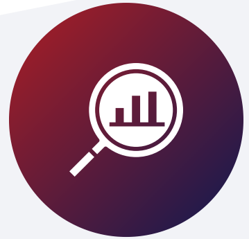
Interactive Data Analytics