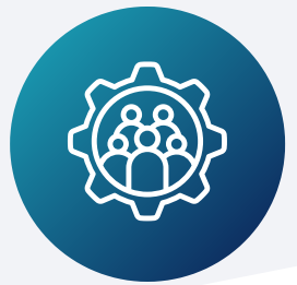
Carrier Network Operation and Performance Management

Connect and standardise multiple carrier networks within a single TMS platform