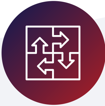
Smooth & Efficient Carrier Integration