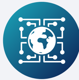
Breakthroughs towards "Digital Fitness"