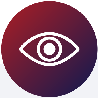
Control Tower Visibility